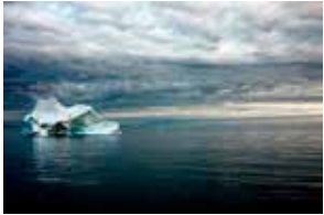
Lost at Sea - West Greenland, August 2009