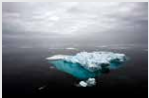
Sea Ice Remnant, Svalbard, July 17, 2008