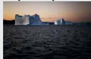
Iceberg in the Evening IV, East Greenland, August 27, 2006