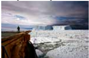
Looking at the Icebergs Near Franklin Island, Ross Sea, Antarctica, Dec. 21 2006