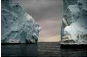
Stranded Icebergs Detail II, Cape Bird, Antarctica, December 25 2006