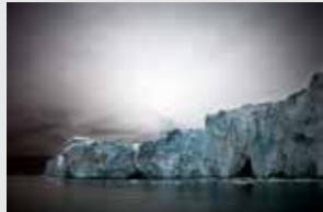
Brae Glacier, Scoresbysund - East Greenland, August 23, 2006