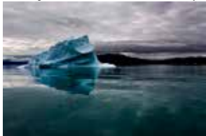
Iceberg in Green Water - Qassiarssuq, Greenland, September 2009