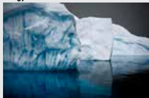
Bergy Bits in Errera Channel, Errera Channel, Antarctic Peninsula, Dec. 2007