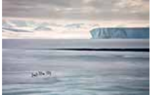
Running to See, Ross Sea, Antarctica, December 2006