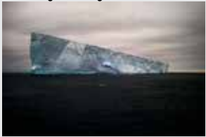
The Wedge Iceberg - Antarctica, January, 1, 2005