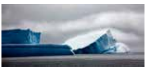
The Cloud Makers Detail - Antarctic Sound, Antarctica, February 2010