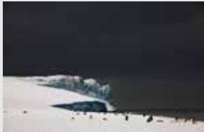
A Day in the Snow, Antarctic Peninsula, December 5, 2007