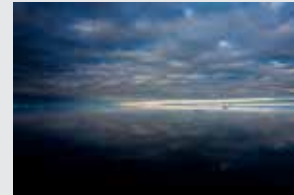
At the End of the World II - Ellesmere Island Greenland, September 2009