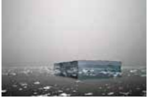
Tabular Iceberg Reflected, Cape Adare, Antarctica, December 2006