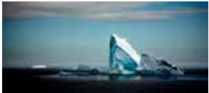
The Shape of Things to Come - Antarctic Sound, Antarctica, February 2010