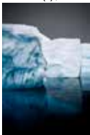
Bergy Bits in Errera Channel(v), Errera Channel, Antarctic Peninsula, Dec. 2007