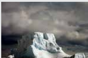
Iceberg Frozen In - Cape Washington, Antarctica, December 26, 2006