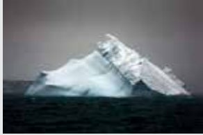
Falling Down Iceberg - Antarctica, December 3, 2007