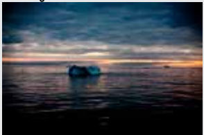
Floating in the Sea - West Greenland, August 2009