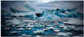
Errera Channel Blocked Up - Antarctic Peninsula December 2008