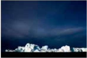
Stuck Under the Moon - Disko Bay, Greenland, September 2009