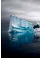
Majestic Iceberg I (v), Errera Channel, Antarctic Peninsula, Dec. 2007