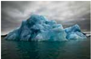
Blue Underside Revealed II, Svalbard, July 5, 2010