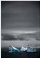
Broken Iceberg(v), Antarctic Peninsula, Dec. 2007