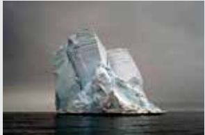
Stranded Iceberg, Cape Bird, Antarctica, December 25 2006