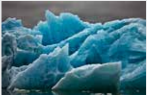
Blue Underside Revealed Detail II, Svalbard, July 5, 2010