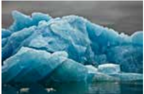
Blue Underside Revealed Detail, Svalbard, July 5, 2010