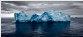
The Ice Crown - Antarctic Sound, Antarctica, February 2010