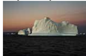
Iceberg in the Evening III, East Greenland, August 27, 2006