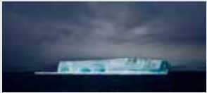
Blue Tabular Iceberg - Antarctic Sound, Antarctica, February 2010