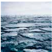
Where the Drift Ice Begins II, 80°N - Arctic Ocean, June 2003