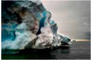
Dirty Iceberg, Cape Bird, Antarctica, December 25 2006