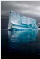
Majestic Iceberg II (v), Errera Channel, Antarctic Peninsula, Dec. 2007