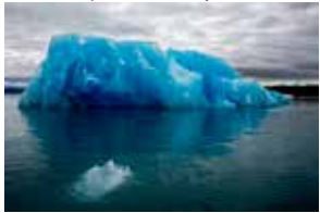
Bottoms Up - Qassiarssuq, Greenland, September 2009