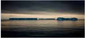
The Sentinels - Antarctic Sound, Antarctica, February 2010