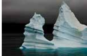
Grand Pinnacle Iceberg Detail - East Greenland, August 23, 2006