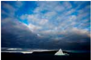
Iceberg Pointing Up - North West Greenland, September 2009