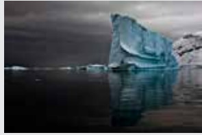
Majestic Iceberg III, Errera Channel, Antarctic Peninsula, December 15, 2007