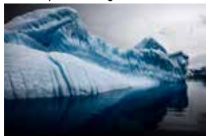
Sun Dimpled Iceberg in Errera Channel - Antarctic Peninsula, December 2007