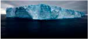
There is a Crack In Everything - Antarctic Sound, Antarctica, February 2010