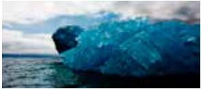
Overturned Iceberg - Qassarsuk, Southern Greenland, August 2008