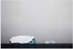
Drifting Icebergs Near Elephant Island, Antarctic Peninsula, December 2007