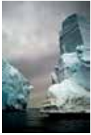
Stranded Icebergs Detail, Cape Bird, Antarctica December 25, 2006