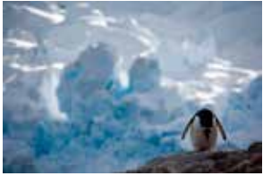
Gentoo with Glacier, Antarctic Peninsula, December 2007