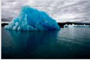
Giant Blue Snow Cone - Qassiarssuq, Greenland, September 2009