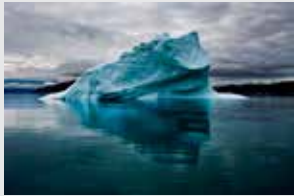
Iceberg with Seal Blood - Qassiarssuq, Greenland, September 2009