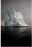
Stranded Iceberg I(v), Cape Bird, Antarctica, December 25 2006