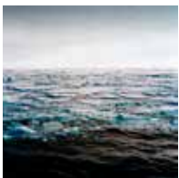
Where the Drift Ice Begins I, 80°N - Arctic Ocean, June 2003