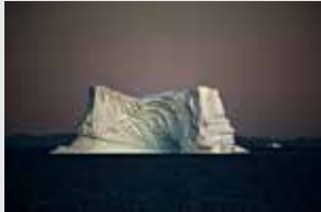
Iceberg in the Evening - Greenland, August 11, 2009