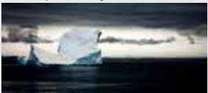
The Shape of Things to Come II - Antarctic Sound, Antarctica, February 2010