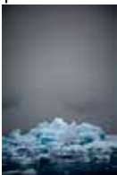
Bergy Bits Jammed Up in Errera Channel(v), Antarctic Peninsula, Dec. 2007