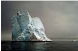
Stranded Iceberg III, Cape Bird, Antarctica December 25, 2006