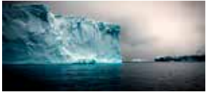
Tabular Iceberg Detail - Antarctic Sound, Antarctica, February 2010