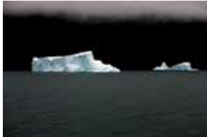
Icebergs Floating By - East Greenland, August 23, 2006