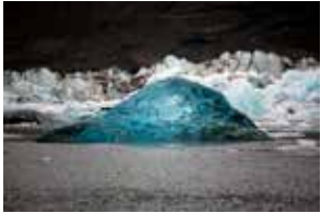
The Jewel Berg - Svalbard, July 18, 2008