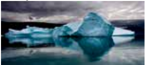
Iceberg Reflected - Qassarsuk, Southern Greenland, September 2009