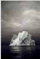
Stranded Iceberg II (v), Cape Bird, Antarctica, December 25 2006