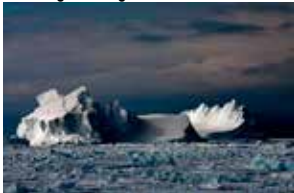
Floating Icebergs in Drift Ice II, Ross Sea, Antarctica December 2006