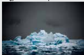
Bergy Bits Jammed Up in Errera Channel, Antarctic Peninsula, Dec. 2007