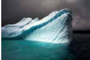
Breaching Iceberg - Greenland, August 8, 2008