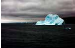
Grounded Iceberg, East Greenland, August 24 2006