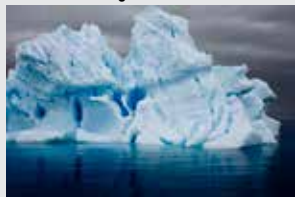
Electric Iceberg in Errera Channel, Antarctic Peninsula, Dec. 2007